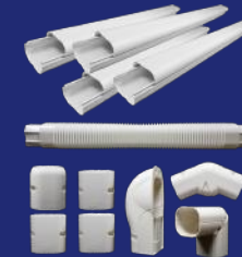
Line Cover Kit