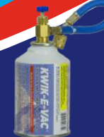
Line Set Flushing Kit