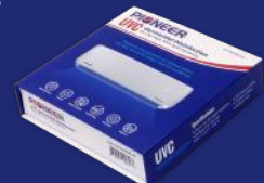
UVC Bacterial Disinfection Kit