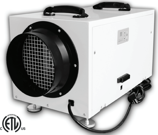
Model Reference Number : QHD070AUDH26WH