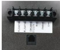
Alternative External Control Provisions