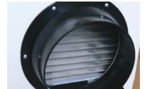
Durable Stainless Steel-Made High-Density Air Filter