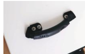
Heavy Duty Carrying Handles for Ease of Transport