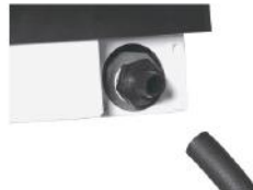
Built-in Pump Along with Manual Drain Option