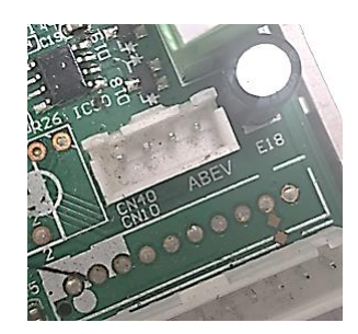
Figure 4 - CN40 on ceiling units (4-pin connector) for the wired thermostats.