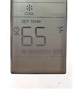
Figure 2 - RG10 screen, note the symbols on the top right corner.