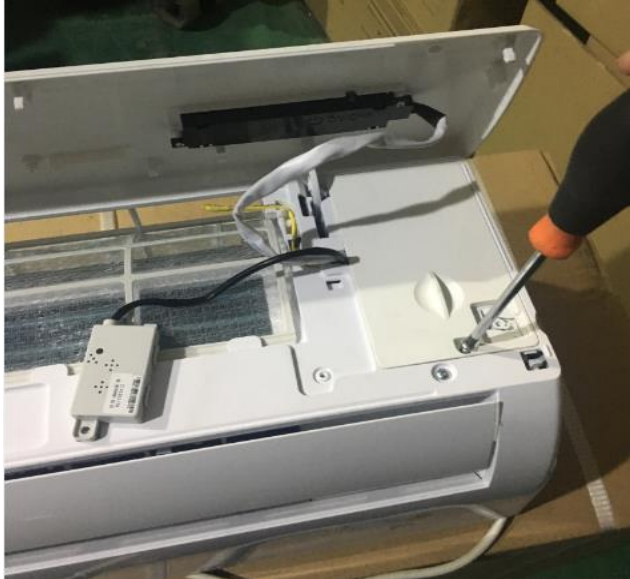
7. Screw on and fix the wifi module on panel frame.