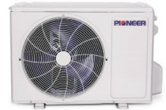
Outdoor Condensing Unit