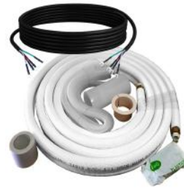
Installation Kit (Pipe+Cable)