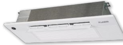
Single-Way Cassette Indoor Unit

*Med Heat (17°F) = 8000 BTU / Low Heat (5°F) = 7700 BTU / COP(5°F) = 2.34