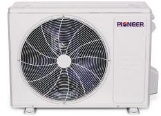
Outdoor Condensing Unit